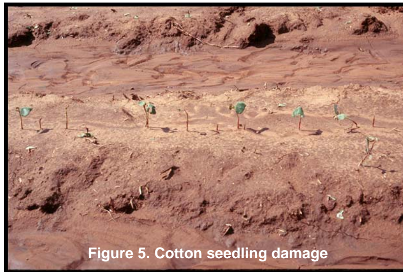
Figure 5. Cotton seedling damage

Evaluation of acutely damaged crops can be relatively straightforward, especially if normal growing conditions prevail after injury occurs. The rate and extent of crop recovery will be largely dependent on the level of damage to the stems and leaves. Plants cut-off below the cotyledonary nodes will not survive. Likewise, those with deep stem bruises may eventually die or only partially recover. Plants that have terminals destroyed may survive if viable buds remain on the plant and the portion of the stem below these buds is intact. Likewise, plants that are essentially defoliated can survive if stem damage is minimal. Any remaining viable leaf tissue (whole leaves, portions of damaged leaves) will increase the chance for survival and hasten recovery of plants with intact stems.