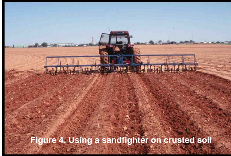
Figure 4. Using a sandfighter on crusted soil

When making replant decisions, the first rule is to not make the final judgment on the extent of crop damage too quickly. Cotton has a tremendous capacity to recover from adversities. Consequently, it is usually best to delay the final stand evaluation until after the crop is exposed to 2 or 3 days of good growing conditions. During this initial period, it is important to protect the crop from further damage by using timely tillage operations. Tillage of crusted fields will minimize wind and sand damage, improve aeration, and hasten warming and drying of the soil that in turn will slow development of seedling disease (Figure 4).